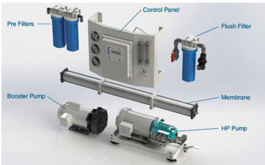
Modular SX 600 GPD shown