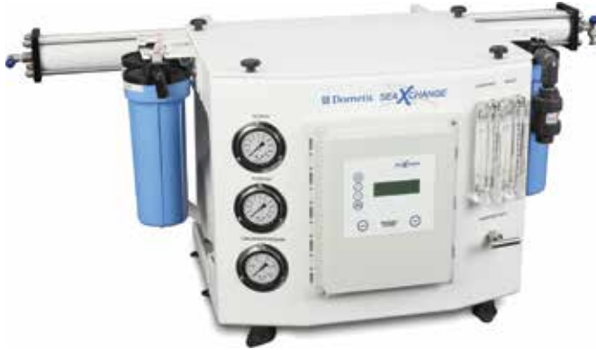
Dometic Sea Xchange SX600 reverse-osmosis watermaker system

Continuous High Performance Meets High Output Demands